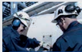
COMMISSIONING FAT / SAT