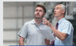
TRAINING & AFTER SALES SUPPORT