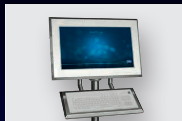
Operator station MANTA GMP

The major part of R. STAHL human-machine interfaces and HMI solutions are certified for use in hazardous areas Zone 1, 2, 21, 22, Class I, Division 2 / Class II, Division 1, 2 / Class III – they are suitable for use in harsh environments, aboard ships, and in GMP and cleanroom environments.