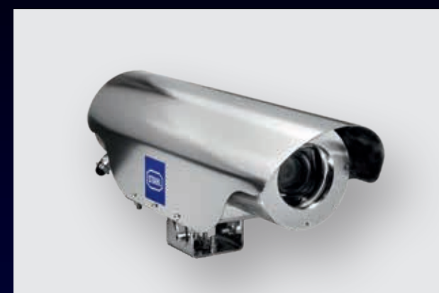
Full HD AFZ camera

R. STAHL cameras have been designed for use in hazardous areas Zone 1, 2, 21, 22, Class I, Division 2. Of superior quality and performance, they ensure reliable operation in harsh and extreme temperature environments.