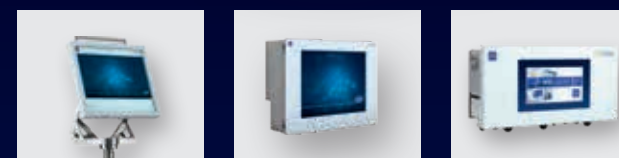
Operator station SHARK