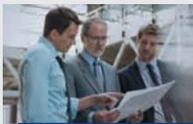
CONSULTING & DESIGN EXPLOSION PROTECTION