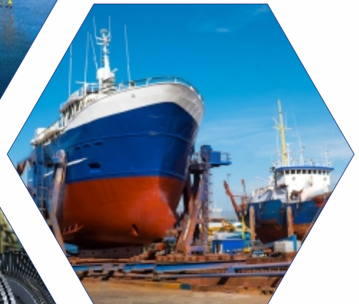
Marine and ship building industry