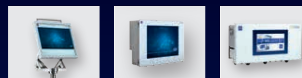
Operator station SHARK